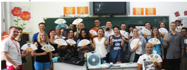
v. January 2020